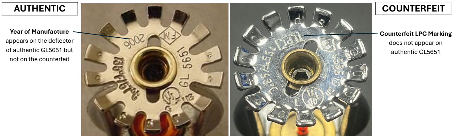
Figure 2. Photographs of the authentic GL5651 deflector (left) and the counterfeit GL5651 deflector (right).

Figure 2 shows the deflectors of the authentic (left) and the counterfeit GL5651 (right). The authentic sprinkler is marked with the year of manufacture while the counterfeit is not. The counterfeit deflector is stamped with the LPC certification marking which is not one of the certifications of the authentic GL5651.